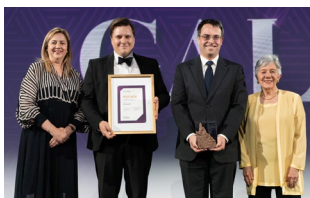
Emerging Exporter Chronosoft