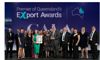
Manufacturing and Advanced Materials