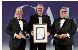
Regional Exporter Mort & Co