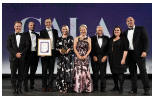
Sustainability and Green Economy Hydrobiology