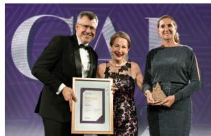
Creative Industries EventsAir