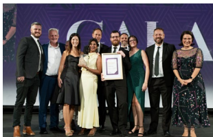
Advanced Technologies Healthcare Logic

The prestigious awards celebrate the best of our state's exporters across a number of categories.