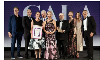
Small Business Genics