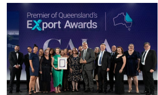
Queensland Exporter of the Year Frosty Boy Global