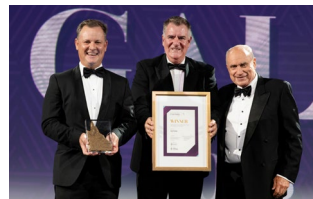
Agribusiness, Food and Beverages AgTrade

Proudly supported by Department of Agriculture and Fisheries