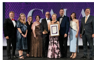
International Education and Training TAFE Queensland