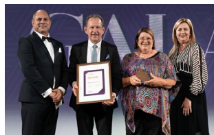
First Nations Mainie Australia