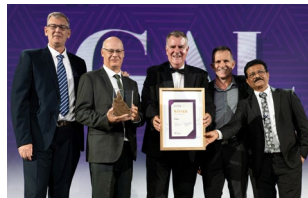
Resources and Energy Phibion