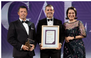
Professional Services Medical Rescue