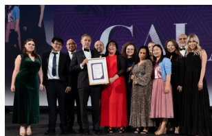
International Health Qlicksmart